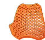
CHEST D30® PROTECTION CP1 L1 CHEST CERTIFIED EN1621-3 LEVEL 1

SHOT AIR GUARD SRG-1 BLACK SIZES XS to 2XL 506-SRG1