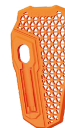
BACK D30® PROTECTION SPECIAL IN&MOTION BP L2 CERTIFIED EN1621-2 LEVEL 2