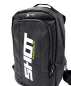
HYDRA BAG TRAIL CLIMATIC BLACK A06-41F1-A01