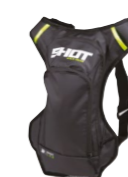
HYDRA BAG RANDO CLIMATIC BLACK A08-41E1-A01