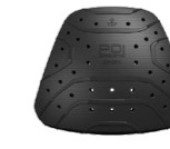
CHEST PROTECTION CERTIFIED EN1621-3 LEVEL 2

SHOT AIR GUARD SRG-1 L2 BLACK SIZES XS to 2XL 506-SRG1L2