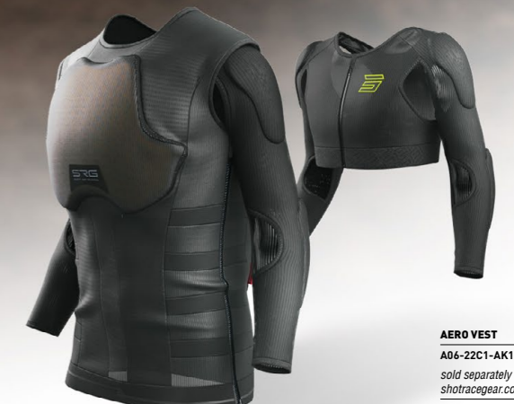
AERO VEST A06-Z2C1-AK1 sold separately shotracegear.com

The ultra-light, hyper-ventilated AERO vest protects your shoulders and elbows. CE-APPROVED PROTECTION - Certified EN1621-1 level 1